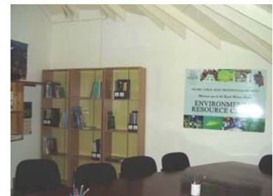
Inside the resource center – Marine Park Headquarters