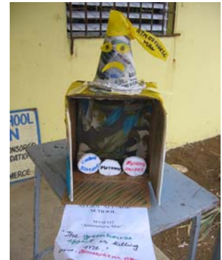
Mini Mascot competition winner, "Atmospheric Man"